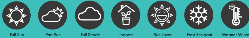
Full Sun Part Sun Full Shade Indoors Sun Lover Frost Resistant Warmer Winter