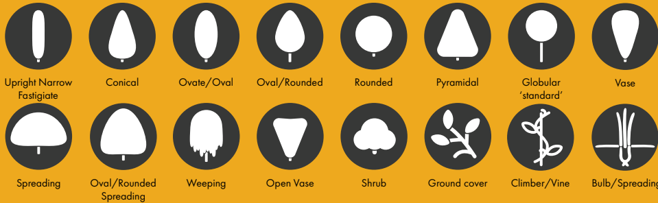
Upright Narrow Fastigate Conical Ovate/Oval Oval/Rounded Rounded Pyramidal Globular 'standard' Vase Spreading Oval/Rounded Spreading Weeping Open Vase Shrub Ground cover Climber/Vine Bulb/Spreading